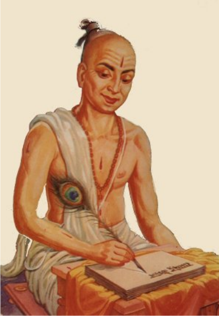
Saint Tulasidas Writing His Masterpiece Ramacharitamanas