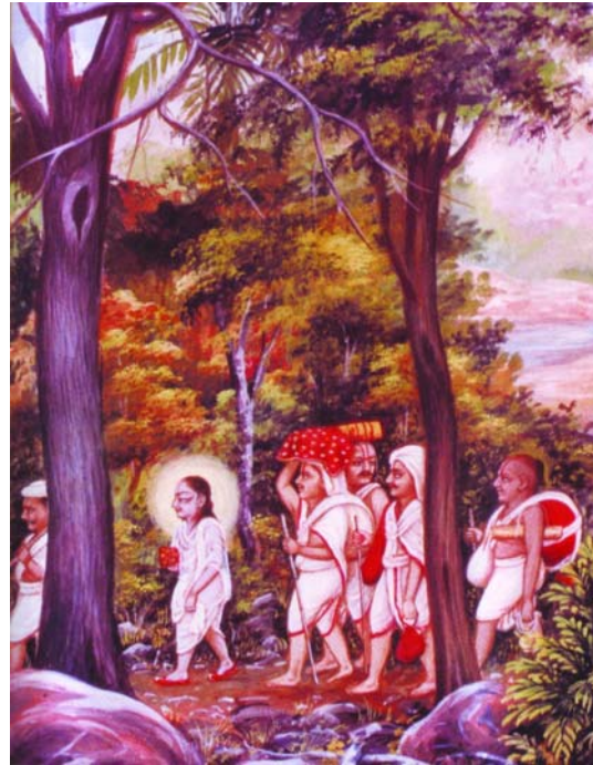
Vallabhacharya ji on pilgrimage